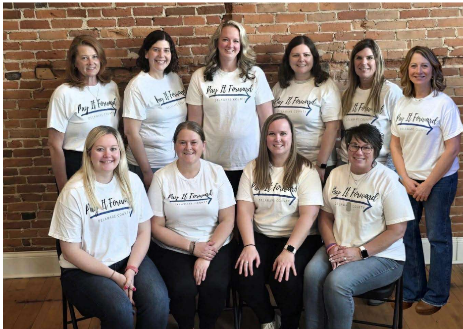
DELAWARE COUNTY PAY IT FORWARD BOARD OF DIRECTORS

Each board member serves without compensation, reinforcing our commitment to mission-driven leadership and responsible stewardship. This diverse leadership structure ensures balanced decision-making, responsible financial oversight, and a deep understanding of the evolving needs within our county. As local residents and community members, our board members are personally invested in the well-being of the community we serve.